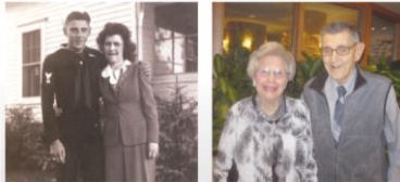
Newmeister 70th Wedding Anniversary

Layout size: Either 3.1"W x 9.2"H (right) or 6.3"W x 4.7"H (shown below). With standard image: Up to approx. 225 words Standard image sizes: Vertical 2.94"W x 4.5"H, Horizontal 6.17"W x 3.2"H. (Multiple or custom image options available)