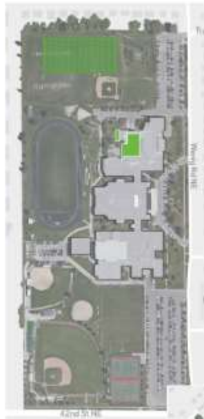
Kennedy High School CTE Renovations, New Turf Field, Cafeteria & Kitchen Expansion